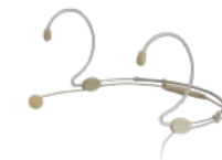
Neckworn Microphone (Condenser, Omnidirectional)