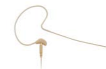
Earhook Microphone (Condenser, Omnidirectional)