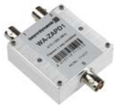
Passive two-way Combiner (470 - 1000 MHz)