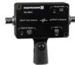
Wideband Antenna Amplifier (5 dB / 10 dB / 15 dB, 470 - 1000 MHz)