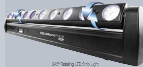
245° Rotating LED Strip Light