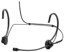
TG H74 Condenser neckworn microphone, with 4-pin mini-XLR connector, available in both black and tan.