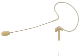
TG H57 Condenser earhook microphone, with 4-pin mini-XLR connector, available in tan.