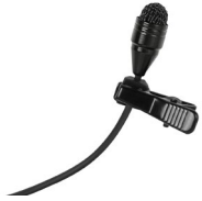
TG L58 Mini condenser lavalier microphone, with 4-pin mini-XLR connector, available in both black and tan.