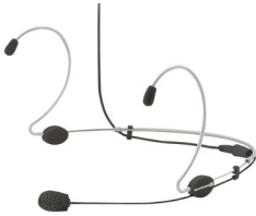
TG H56 Condenser neckworn microphone, with 4-pin mini-XLR connector, available in both black and tan.