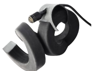
TG I58 Helix Condenser microphone for instruments, with helix clamp, with 4-pin mini-XLR connector, available in black.