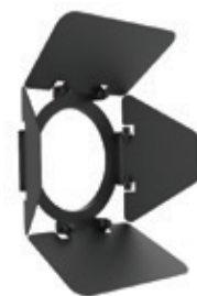
OVATION F 3.5" BARN DOOR