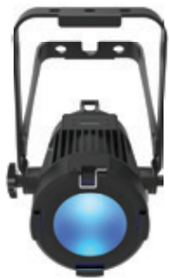
1 LED 40 W, RGBW 5° to 24° zoom