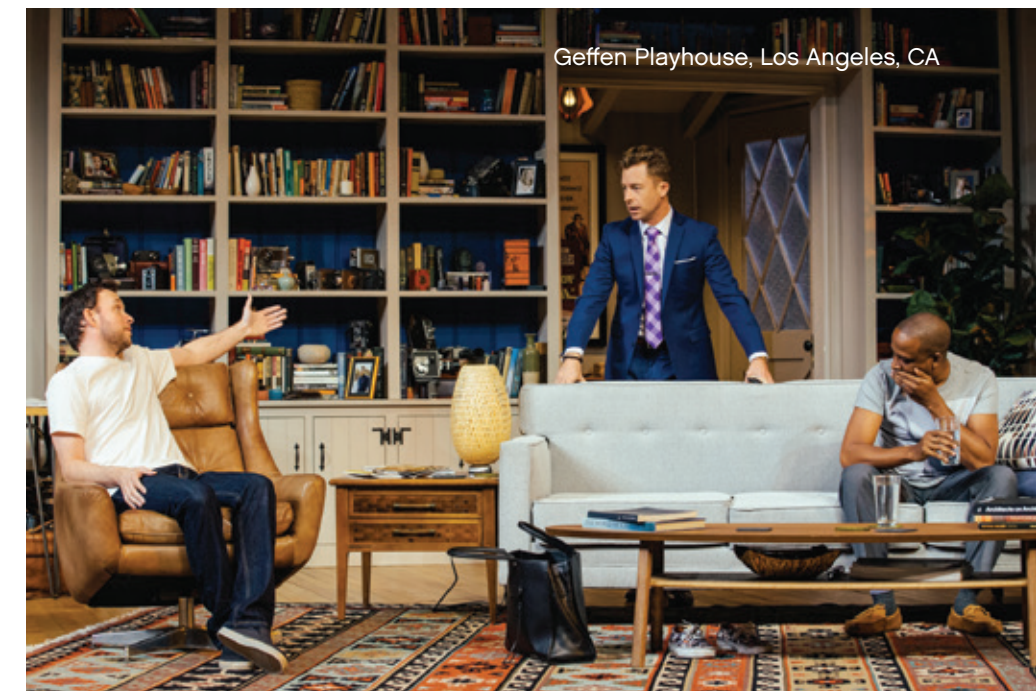
Geffen Playhouse, Los Angeles, CA

All of our Ovation barn doors eliminate light leaks and minimize spillage.