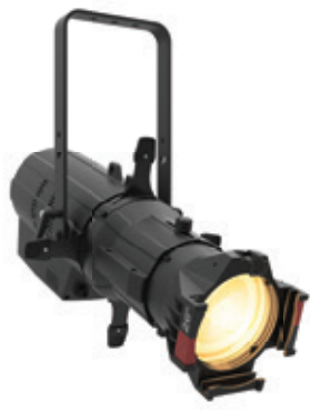
OVATION E-260WW IP

1 LED 230 W, Warm White * Outdoor rated IP65