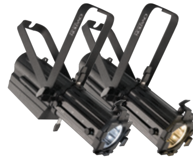
OVATION MIN-E-10CW / WW

1 LED 13 W, Cool White / Warm White * 19° to 36° zoom