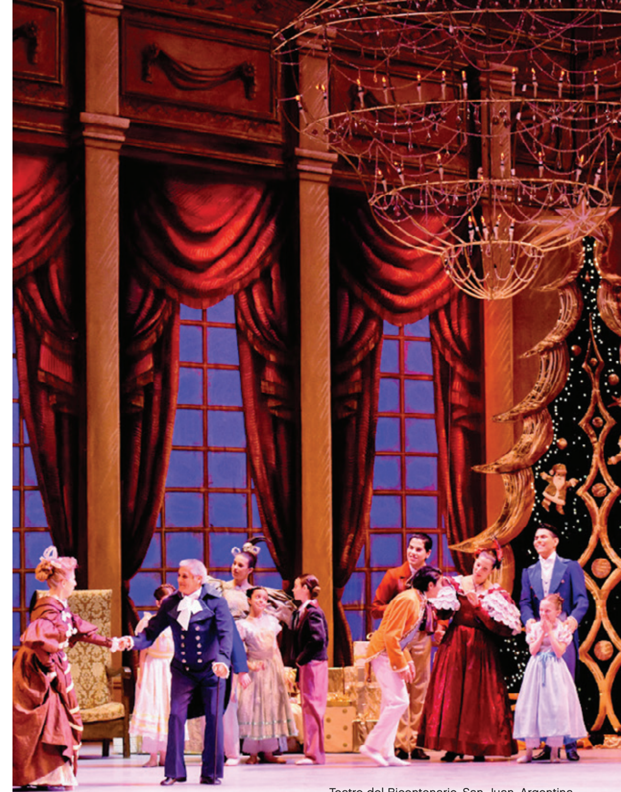
Teatro del Bicentenario, San Juan, Argentina

19 LEDs 10 W, Warm White * True retrofit solution