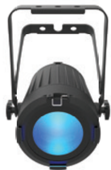
1 LED 60 W, RGBW 8° to 55° zoom