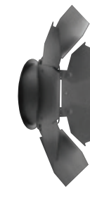
OVATION F 7.25" BARN DOOR

All of our Ovation barn doors eliminate light leaks and minimize spillage.