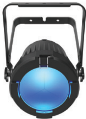
3 LEDs 60 W each, RGBW 8° to 45° zoom