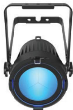
3 LEDs 40 W each, RGBW 7° to 42° zoom